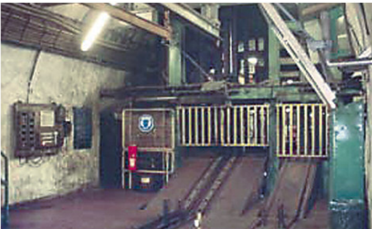
Magnet switch iKA168 used for securing a pit gate